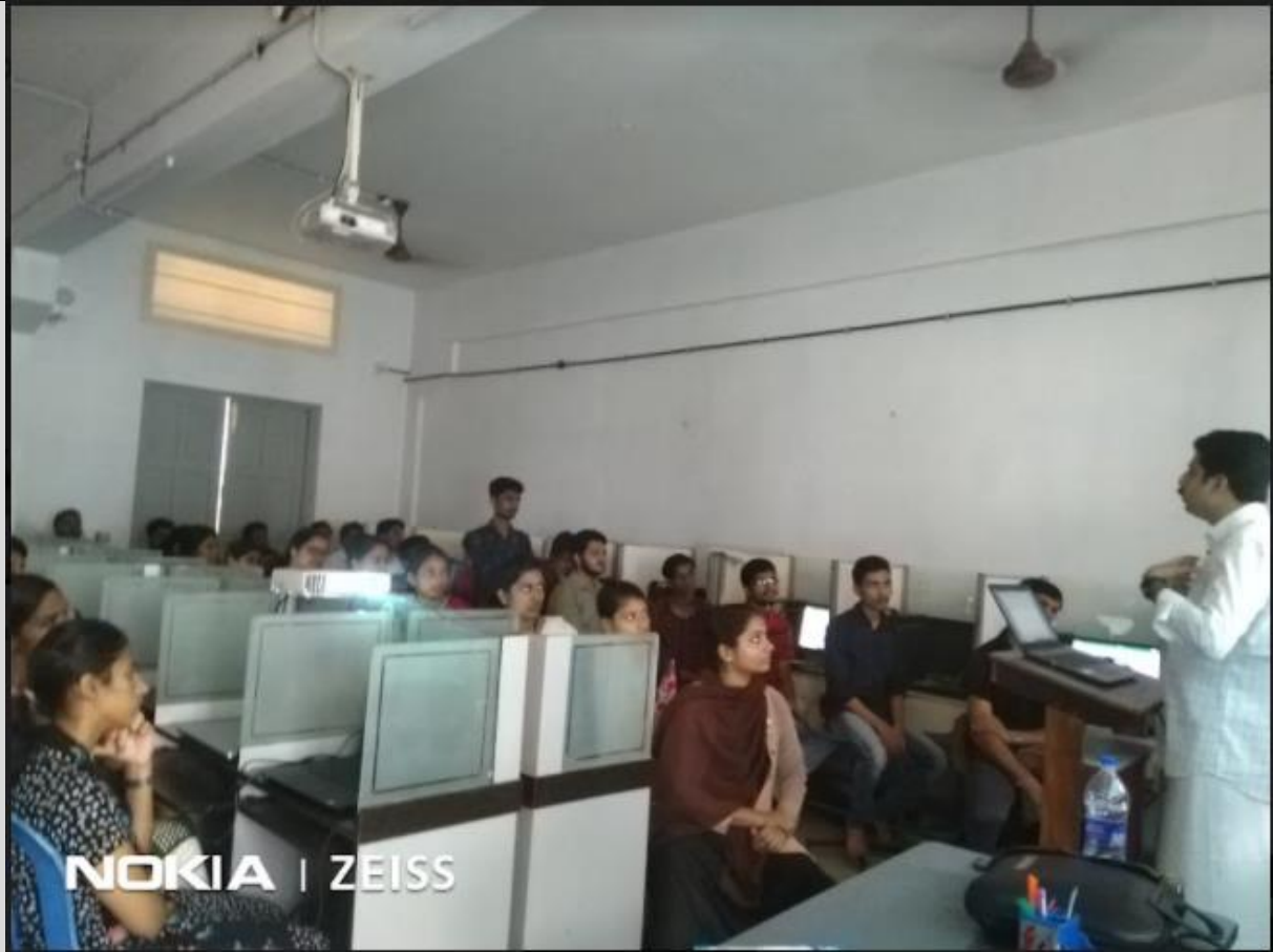
Excel Specialist Training